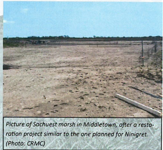
Picture of Sachuest marsh in Middletown, after a restoration project similar to the one planned for Ninigret.

Immediately after the dredged material is spread and graded, the marsh will look much like a mud flat—a bare area of exposed sediment. Over time, salt marsh grasses will begin to recolonize the covered areas. Save The Bay will be working with CRMC to plant a portion of the restored area to “jump start” the natural recolonization process. Many of the plants to be planted will come from seeds collected here in Rhode Island with the help of the New England Wildflower Society. Over the next few years, it is anticipated that healthy salt marsh grasses will again cover the restored marsh. The breachway channel will be deepened significantly to create basins where sediment can accumulate over time.