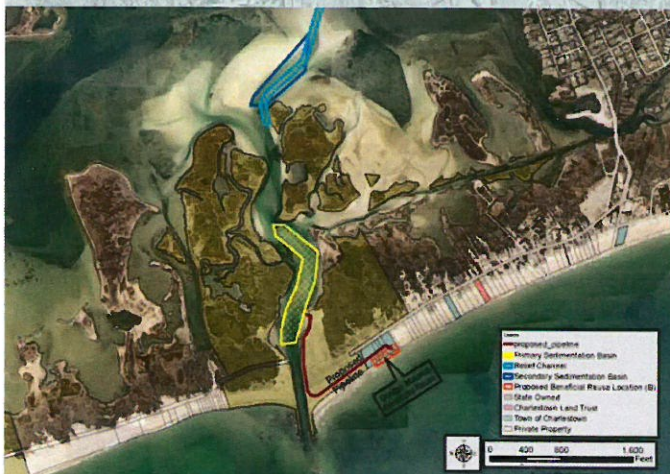
A schematic showing the restoration area, areas to be dredged, and the pipeline location.