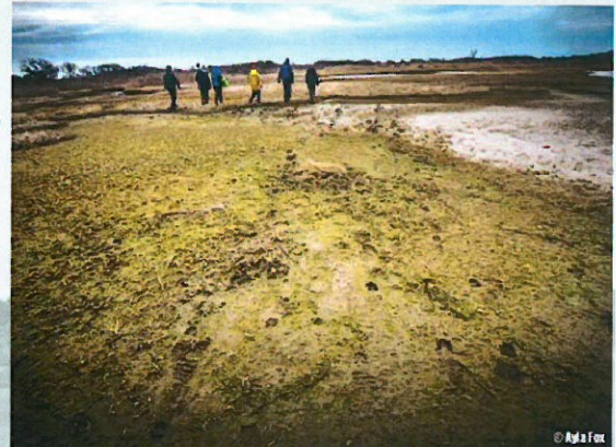
Picture of Ninigret marsh showing areas of vegetation die-off from prolonged flooding.

Within the Charlestown breachway in Ninigret Pond, sand has been accumulating as it is swept in by shoreline currents. As it enters the pond it covers eelgrass beds—an important habitat—and makes navigation difficult for the many boaters who enjoy the pond.