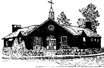
TOWN BUILDING HARRISVILLE, R.I.

Telephone: (401) 568-4300 ext. 124 FAX: (401) 568-0490 E-mail: townclerk@burrillville.org RI Relay 1-800-745-5555 (TTY)